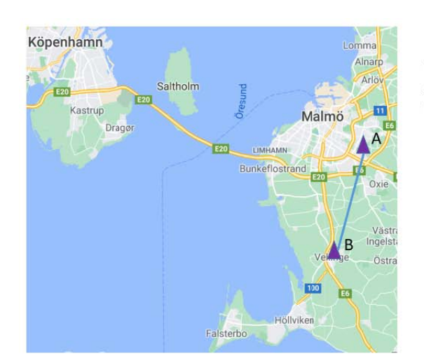
Figure 3 - Fixed radio link Malmö-Vellinge station location (licence held by Excellent Hosting).

Radiolänkshopp – 2 stycken mellan station A och B.