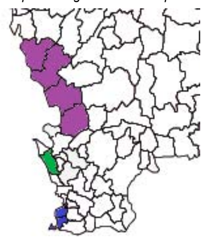
Figure 2: Map showing where the frequencies in figure 1 have been assigned.

Mauve: A and B (see figure 1) Laholm, Halmstad, Varberg and Falkenberg